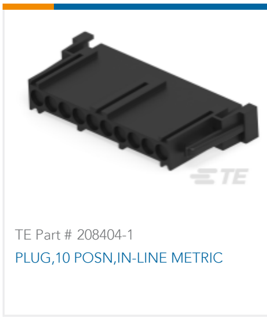
TE Part # 208404-1 PLUG,10 POSN,IN-LINE METRIC