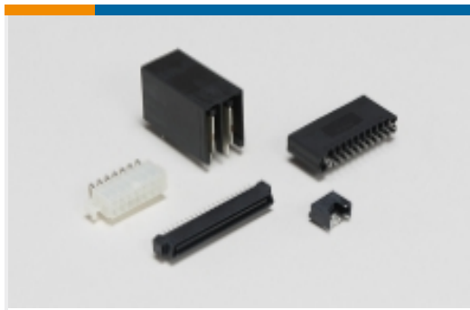
Standard Rectangular Connectors(5)